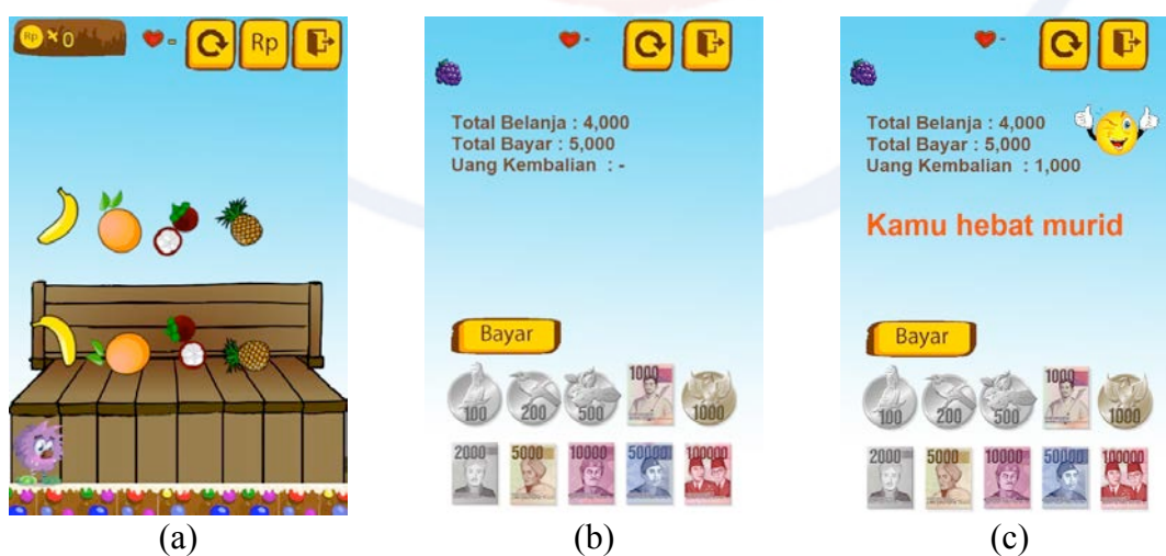
Figure 3. Menu for transaction processes

There is also menu in application that can be used for transaction processes of buying objects or payments.