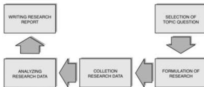
Fig. 1 Research Design Method

The design of qualitative research studies can be described as follows: