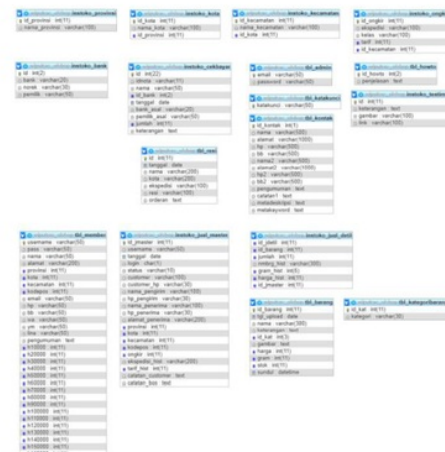
Fig2. Design of Database

The design result in this research is database design. There are 17 tables used in the online sales information system. The database design can be seen in Fig. 2.