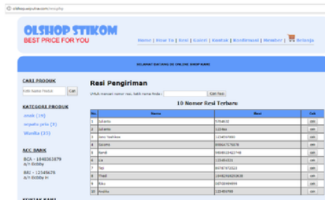
Fig. 15. The progress of the order delivery process

number as described earlier in Fig. 10. On the final stage, consumers can see the progress of the order delivery process as in Fig. 15. So, that's the sequence of online sales process on the website that has been made.