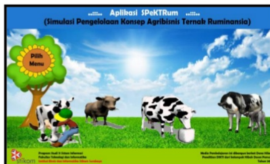
Fig 2. the opening page of the SPEKTRUM Application

This research has been able to produce an application of Simulation of Agribusiness Concept of Livestock (SPEKTRUM) with 7 main menus. Figure 3.1 shows the opening page of the SPEKTRUM Application and Figure 3.2 shows the menus provided in the application.