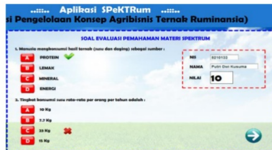
Fig 5. Spektrum Evaluation Menu that has already been done by the student.