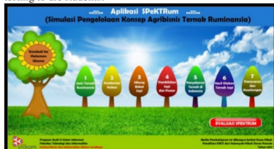
Fig 3. Main Menu Page of SPEKTRUM

Indonesia, processed cattle, and marketing and profit calculations. Addition is done by adding the SPEKTRUM Evaluation Menu located at the bottom of the 7 menus for testing to the students.