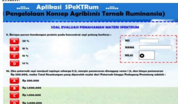
Fig 4. Spektrum Evaluation Menu – Multiple-Choice Questions

To find out the level of differences between the students understanding before using the application and after using the application, the researchers add SPEKTRUM Evaluation Menu to assess the students' final outcome. The value of the Evaluation Results before using the application has been done by the teacher during the Mid Semester Exam.